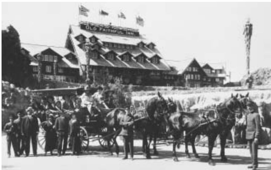
YELLOWSTONE ARCHIVES, YELL 142573

Space constraints prevent us from listing the numerous citations and sources included in this article as originally submitted. For a complete list, please see the book Old Faithful Inn: Crown Jewel of National Park Lodges , © 2004 by Karen Wildung Reinhart and Jeff Henry. Roche Jaune Pictures, Inc., 171 East River Road, Emigrant, Montana 59027, (406) 848-2145, (406) 848-7912, wildhart@imt.net, rochejaune@imt.net.