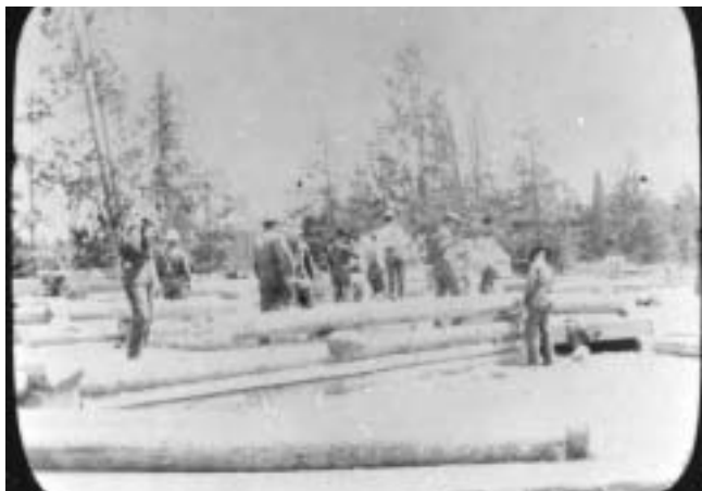
YELL 36626

The need for some of these materials and supplies during winter necessitated arduous oversnow travel. Horse teams, drivers, and heavy freight-bearing sleighs delivered goods from