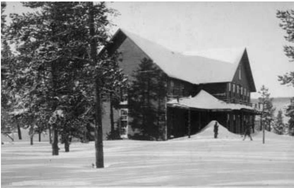
YELLOWSTONE ARCHIVES, YELL 147897

Before construction of the hotel could begin, builders needed timber and supplies on the site. In 1901, the Department of the Interior granted Child permission to harvest local building materials for construction of a new hotel. In early December 1902, Child communicated to Northern Pacific officials his intention to haul lumber by horse-drawn sledge over snow to the Upper Geyser Basin—an experiment he hoped would prove