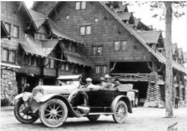
YELL 3198