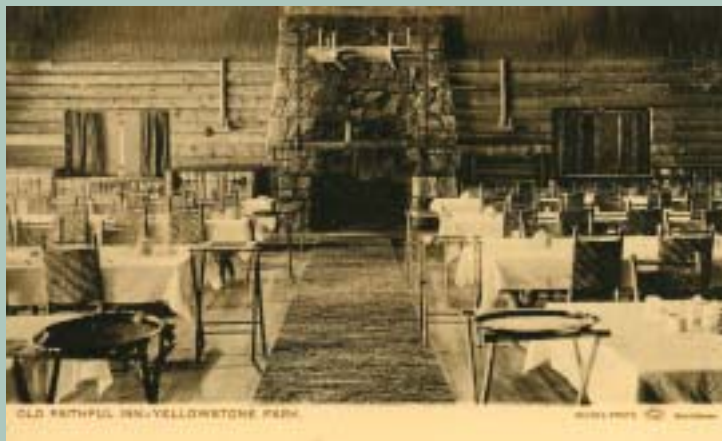
The dining room chimney collapsed and the fireplace cracked in the quake.

A bellman that evening remembered that the relatively quiet lobby suddenly filled with milling guests in various states of attire. Those most anxious to leave eagerly paid the going rate of 20 dollars for bellmen to run up the stairs and down the wobbling halls to hurriedly pack their belongings. Hazardous duty also beckoned bellmen to the bowels of the inn, where they shut off the sprinkler systems