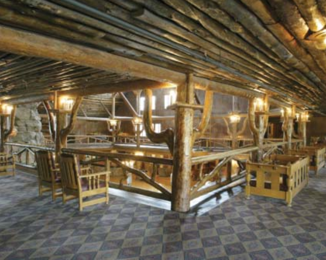
Burled pine branches and electric candlestick lights, dappled by sunlight filtered through the windows, help to create the woody atmosphere of the inn.