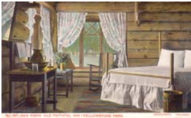
The guest rooms had a rustic coziness.

Some of the original Mission Style pieces from 1904 still grace the Old Faithful Inn. A few heavy oak wooden-armed davenports and chairs in the lobby are original to the inn. The second floor mezzanine’s green octagonal tables originally occupied the upper floor bedrooms but now hold guests’ beverages. Today, a few original drop-front chests of drawers furnish Old House rooms. Refinished versions are used in the gift shop for display. Some of the original wash stands, manufactured by Charles Limbert of Grand Rapids, Michigan, still adorn guest rooms in the Old House. The Old Hickory Chair