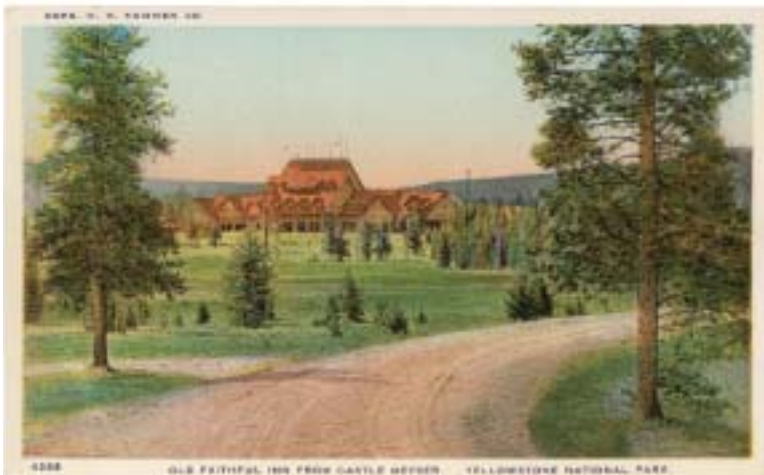
This rare H.H. Tammen Co. postcard shows the inn’s original red roof shingles, which were painted to hinder flammability.

The Old Faithful Inn has been called the “world’s largest log structure.” Indeed, the whole massive structure appears to be constructed entirely of log, lending support to the above claim. However, to dispel that myth, only the first floor of the Old House was constructed of load-bearing unhewn logs. The first floor is eleven logs high; each log was scribe-fitted and saddle-notched, requiring practiced and patient workmanship. Workmen tucked “oakum,” an oily, hemp rope between the logs to serve as chink, chasing away drafts and improving privacy.