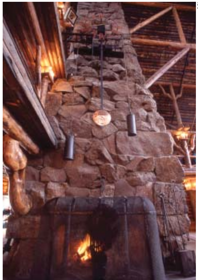
The warmth of the fireplace makes the huge lobby more friendly, and the clock is a work of art in itself.

Blacksmiths, sawyers, and carpenters did much of the work on location—a practical and cost effective approach to the isolated project. Amazingly, construction costs for the Old Faithful Inn totalled only about