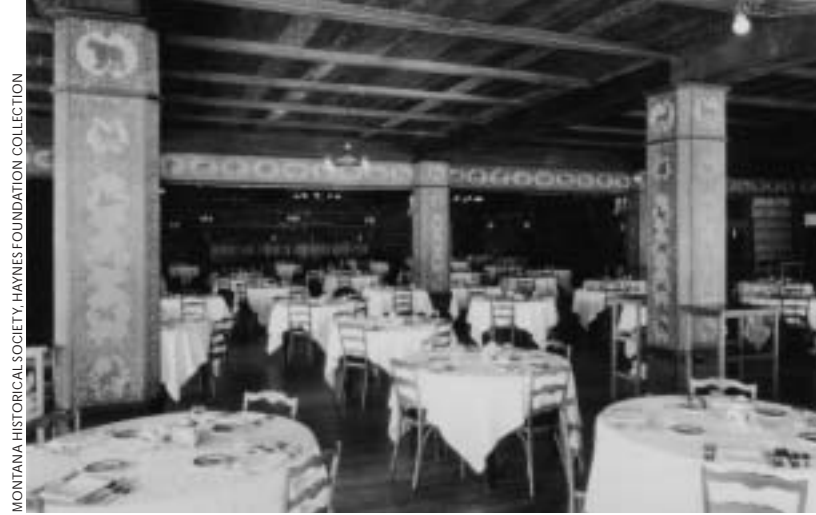
The 1927 dining room addition. J.E. Haynes photo, 1928.

"I told you in my wire that I was as much interested in the appearance of Old Faithful Inn as the Government, and I will go further, and say it means a lot more to me...I hope