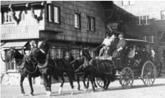
YELLOWSTONE ARCHIVES, YELL 547