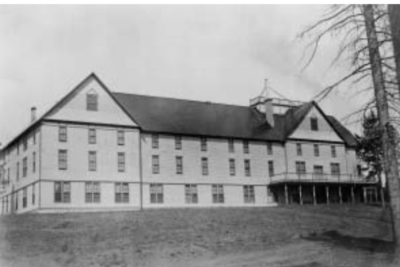
The Lake Hotel, ca. 1895, was a generic clapboard hostelry.

At the lake, Reamer's projects were both large and small. He had a tremendous impact on the appearance of the Lake Hotel, transforming it in 1903–1904 from a generic clapboard hostelry to the "Grand Lady of the Lake." He returned on several occasions in the 1920s to oversee further additions to the hotel, so its appearance today is largely a reflection of his ideas. Less well known are Reamer's designs for the lunch station at West Thumb and the operator's building used by the Yellowstone Park Boat Company, which stood until 1963, just downstream from the Fishing Bridge on the west side of the river.