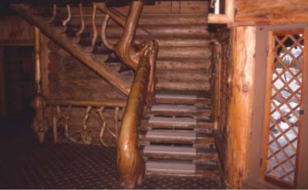
Reamer used burlled pine to create intimate spaces within the expanse of the inn.