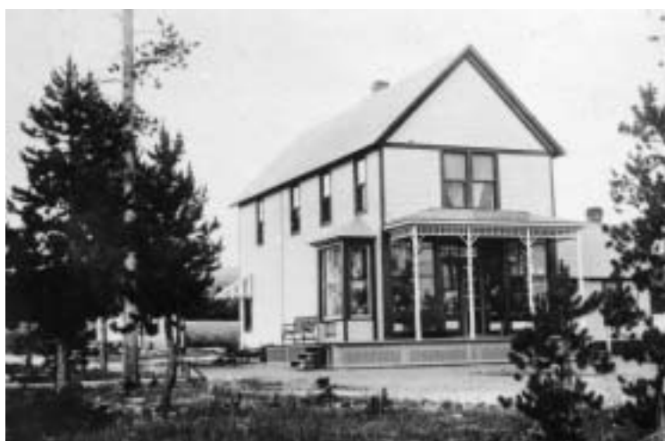
YELLOWSTONE ARCHIVES, YELL 3167-1

Perhaps inspired by the construction he had been watching throughout the summer of 1903 on the nearby hotel, Klammer petitioned the Department of the Interior for permission to add to his store. Correspondence indicates that this request and reply occurred in the fall of 1903, though Reamer’s plans are dated simply “1903.” 78 There is no indication that