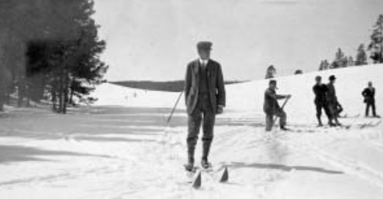
YELLOWSTONE ARCHIVES, YELL 89301-10

“To be at discord with the landscape would be almost a crime. To try to improve upon it would be an impertinence.”