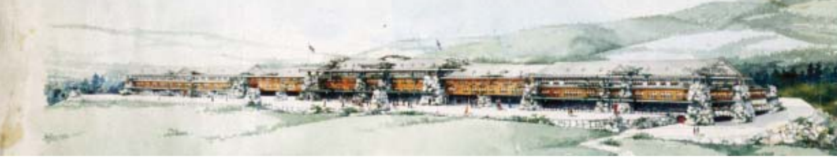
Reamer's 1906 proposal for the Mammoth Hot Springs Hotel.