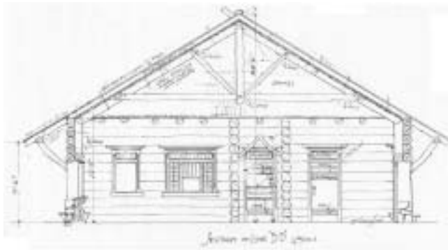
MONTANA HISTORICAL SOCIETY LIBRARY F.J. HANNES ARCHITECTURAL DRAWINGS COLLECTION

This high-profile project was the first in the Yellowstone area to earn Reamer recognition. Constructed on a rough-cut stone foundation, the round log depot provided a strong first impression and “created a rustic effect that welcomed tour-