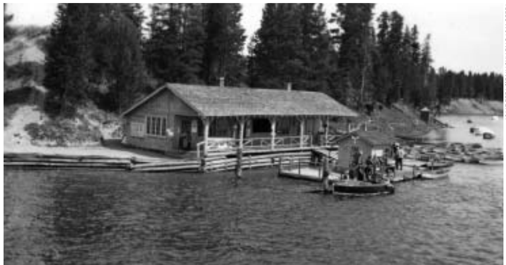
YELLOWSTONE ARCHIVES, YELL 29931