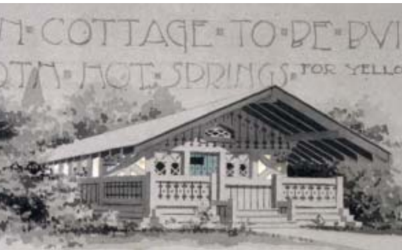
Reamer's drawing of the Chinese Gardens cottage.

Reamer's final work on a hotel facility at Mammoth took place from 1934 to 1938, when he designed the three major