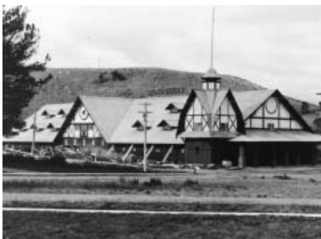
YELLOWSTONE ARCHIVES, YELL. 30466

Another charming building that Reamer designed and built in a bungalow style was the commissary store for the YPHC, immediately behind the Mammoth Hotel. This building was probably constructed in 1903 or 1904, and was demolished in 1937 to make way for the recreation hall and