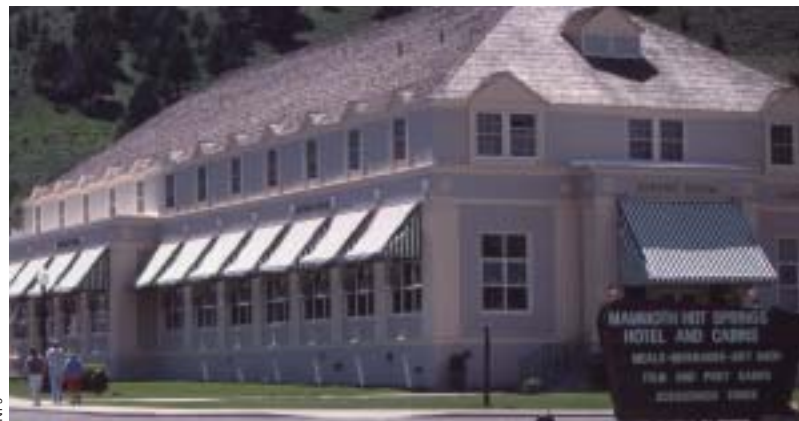
The Mammoth Hot Springs dining room today. Here, Reamer achieved an Art Deco Style, using roof-line dormers and trim on the windows and corners of the dining room.

MONTANA HISTORICAL SOCIETY LIBRARY F.J. HAINES ARCHITECTURAL DRAWINGS COLLECTION