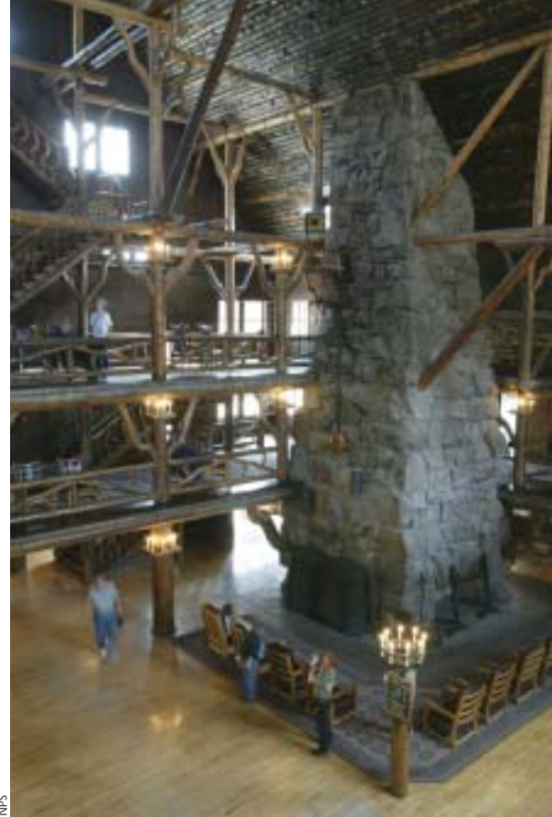
The fireplace is still a welcoming area.