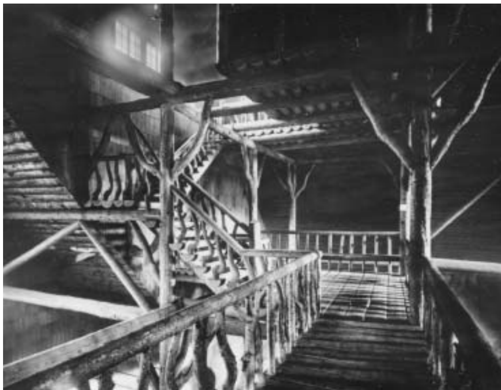
Light filters through the windows of the Old Faithful Inn.