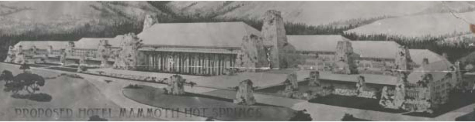
Reamer's 1909 proposal for the Mammoth Hot Springs Hotel.