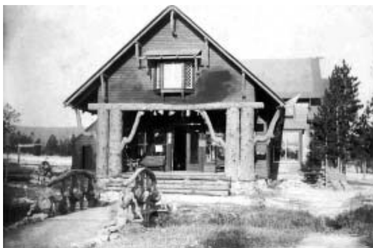
YELLOWSTONE ARCHIVES, YELL 688