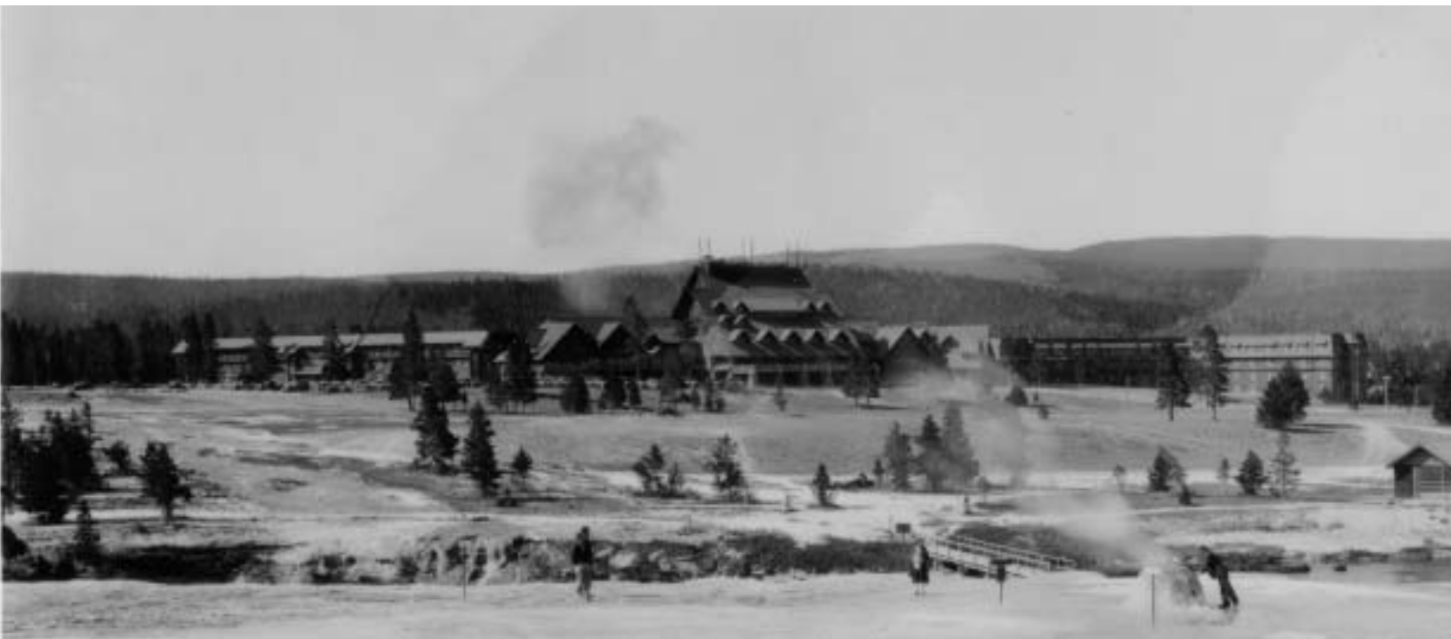
The Old Faithful Inn from Beehive Geyser cone. Haynes photo, 1929.

MONTANA HISTORICAL SOCIETY, J.E. HAYNES FOUNDATION COLLECTION