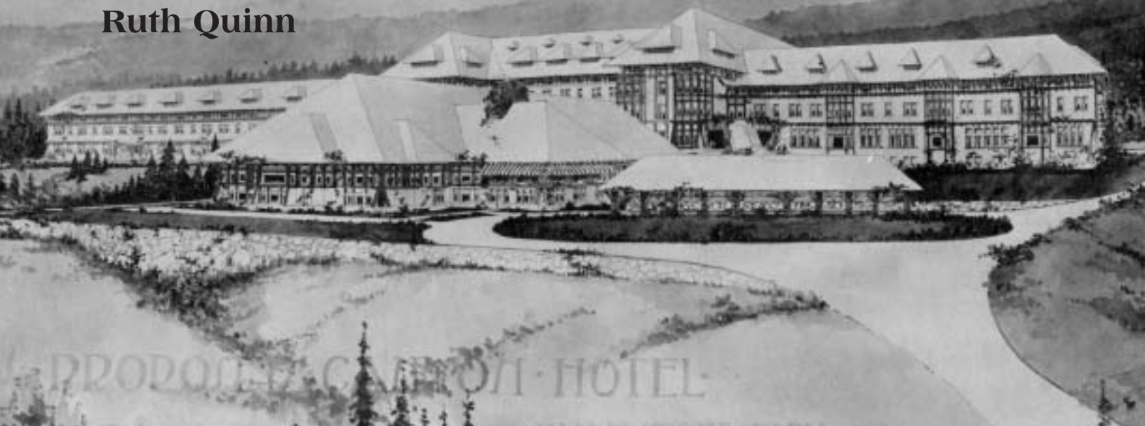
A Reamer drawing of the proposed Canyon Hotel, built in 1910.