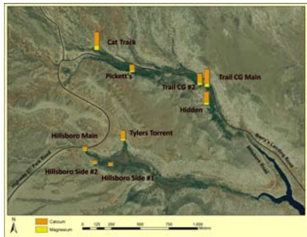
Figure 2. Map showing locations and chemical composition of Hillsboro and Trail Creek springs in Bighorn Canyon National Recreation Area.

Underground geology strongly influences spring water chemistry. Bighorn Canyon springs commonly flow through Madison limestone, Bighorn Dolomite, and Tensleep Sandstone strata. The map of spring calcium and magnesium illustrates that springs in close proximity, such as Hillsboro Main and Tyler’s Torrent, can have different chemical signatures because they travel through different underground flow paths or mix before emerging (Fig. 2). These springs also vary greatly in their flow rates, which range from 0.008 L/s (Hillsboro Side #1) to 7.55 L/s (Hillsboro Main). If climate change reduces underground reservoir levels, this could reduce residence time and lead to changes in water chemistry and flow in these low-volume systems.