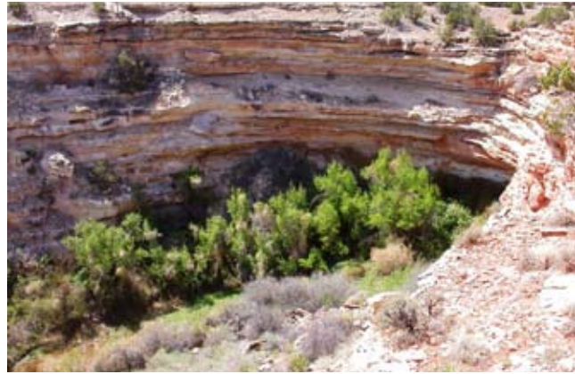
Hillsboro Spring, April 2004.

As a major source of surface water in Bighorn Canyon National Recreation Area, aridland springs are often ecological and cultural hotspots. Springs cover less than 1% of the land area within the park, yet prehistoric peoples, as well as animals from neighboring uplands, have gravitated to springs for centuries for water and food. While the southern end of the park receives only 6–10 inches of rain per year, springs support a high biodiversity in wetlands. Some springs support rare species, such as the plant Hapeman’s coolwort ( Sullivantia hapemanii var. hapemanii ), by maintaining a narrow range of environmental conditions. Major threats to Bighorn Canyon springs include 1) trampling by ungulates and visitors, 2) water withdrawal, 3) the introduction of non-native species, and 4) long-term drought.