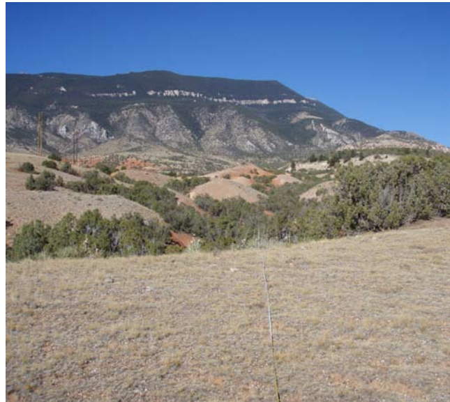
Biological cover helps protect arid soils from erosion.

In 2004, the Natural Resources and Conservation Service (NRCS) reported that approximately half of the rangeland in and around Bighorn Canyon NRA is at risk for site degradation and that the other half has already deteriorated. 1 This includes 21% of the Pryor Mountain Wild Horse Range (PMWHR), which lies in the southern part of Bighorn Canyon NRA and is managed by the park. Rangeland health has deteriorated since at least the 1980s; the NRCS reported that at least 31% of the PMWHR within Bighorn Canyon NRA was experiencing severe erosion. 2 In 2004, vegetation communities had only 44% similarity to baseline data collected in 1981 and key forage species, such as Idaho fescue ( Festuca idahoensis ), bluebunch wheatgrass ( Pseudoroegneria spicata ), and Indian ricegrass ( Achnatherum hymenoides ), were particularly hard hit. 2 Rangeland health varies considerably within the PMWHR though most of the deterioration occurs near perennial water sources where horses, a nonnative species, congregate. A 2008 pilot study by the Greater Yellowstone